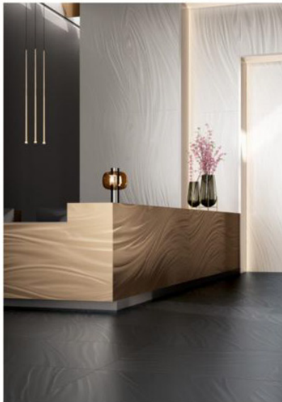
The tiles are antibacterial, anti-viral, anti-odour and self-cleaning

The Luce range is available with Fiandre's patented Active Surfaces innovation, in which ceramic slabs are transformed into eco-active materials via a process called photocatalysis.