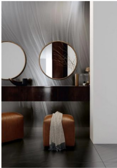
The tiles can be used as flooring, wall coverings, cladding and for furnishings

The tiles are suitable for indoor and outdoor applications and are intended for commercial and residential settings, as well as external facades. The material can also be used for furnishings and accessories.